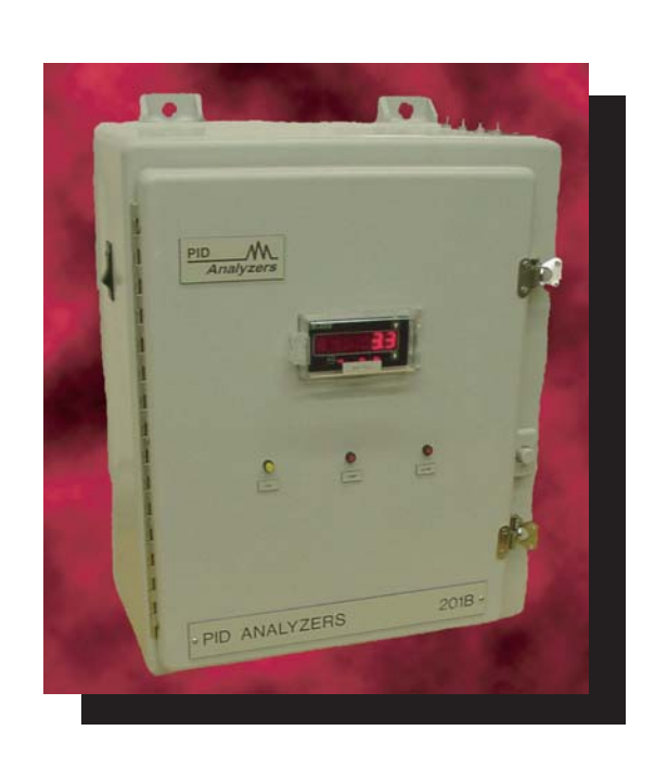
Model 201B Wallmount

For Stacks, Process, Carbon Bed Breakthrough, Drying Ovens, Leak Detection Environmental & Process Measurement in Chemical, Petrochemical, & Manufacturing Plants