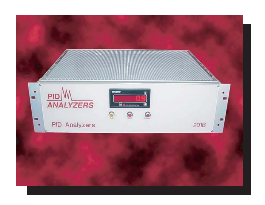
Model 201B Rackmount